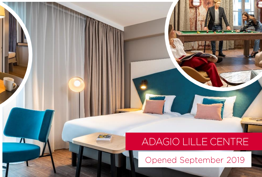
ADAGIO LILLE CENTRE