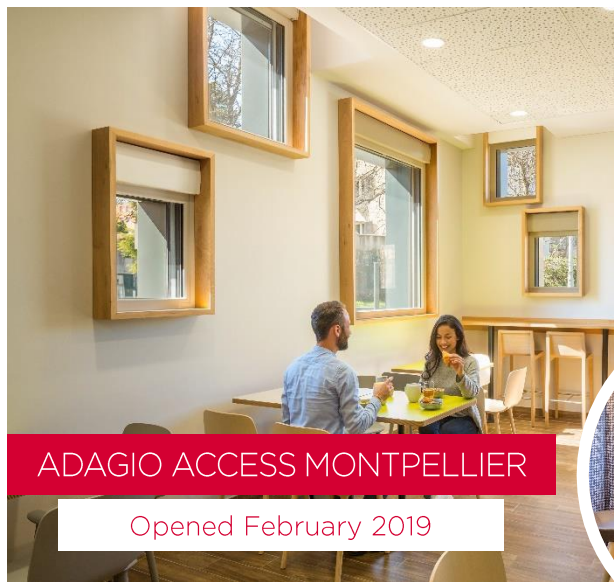
ADAGIO ACCESS MONTPELLIER